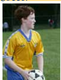
7 th -8 th Grade Boys Varsity Soccer