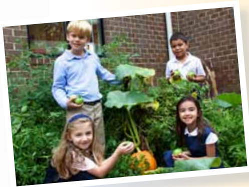
First Graders enjoy harvesting the food they planted as Kindergarteners.