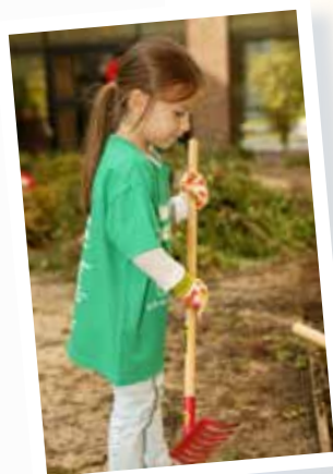
Kindergarten students learn how to take care of the resources God created.

In the winter we plan our gardens for spring planting. We will grow plants from seeds and transplant them when the weather is warm and the plants are strong enough. This year we will have two types of gardens growing, an herbal garden that needs less sun and a vegetable garden that needs more sun. Throughout all the gardening, children are learning about words, computations, measurement, soil, weather, recycling, care for the earth and its animals and much, much more. It is a hands-on curriculum that teaches about the Living Curriculum! ●