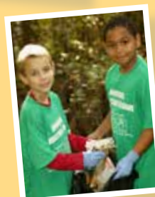
All School Serve-A-Thon