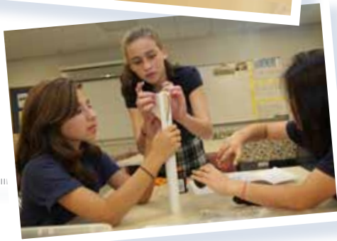
(Above) Students learn about rocket design and function as they work together to build their rockets.